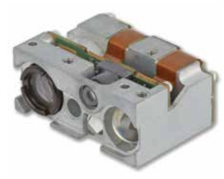
Extended FlexRange EX30 2D Scan Engine

The Extended FlexRange EX30 may easily be embedded into mobile devices running under an OS by using the resources of the device's main processor. Honeywell supports its customers with integrating decoder software into their solutions, saving the cost of ownership by eliminating hardware and also enhancing performance by using the main processor's power.